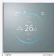
Kagami Wired Remote Controller UTY-RVRY