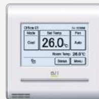
Wired Touch Controller* UTY-RNRYT5