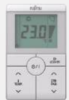
Simple Wired Controller (without Operation mode)* UTY-RHRYT