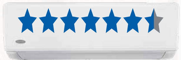
*6.5 stars rating on 2.6kW system Cooling

Whether in the bedroom, home office, study, kids room, or guest room, the Indigo series 2.6kW model boasts an impressive 6.5 ZERL star rating for cooling. This ensures excellent air conditioning, enabling your family to unwind, stay comfortably cool, and embrace energy efficiency – a true win-win!