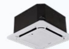
Mini-Cassette Series 2