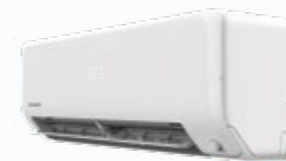
Serene Series 2 Wall Hung Split